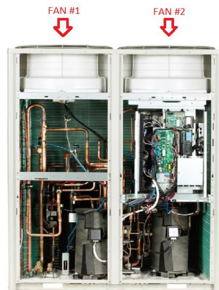
Fan #1 is on the left-hand side of unit

See the Video showing this troubleshooting technique. Click the icon below: