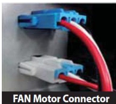
FAN Motor Connector