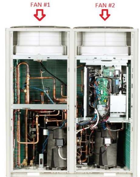
Fan #1 is on the left-hand side of unit

See the Video showing this troubleshooting technique. Click the icon below: