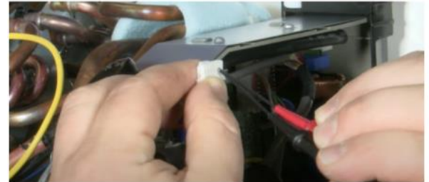
Test with needlepoint leads on the 2 silver tabs

Always refer to wiring diagram for specific model.