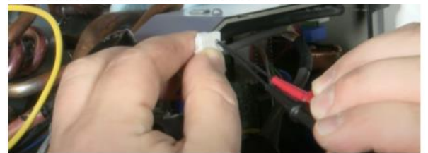
Test with needlepoint leads on the 2 silver tabs