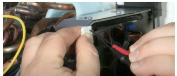
Test with needlepoint leads on the 2 silver tabs