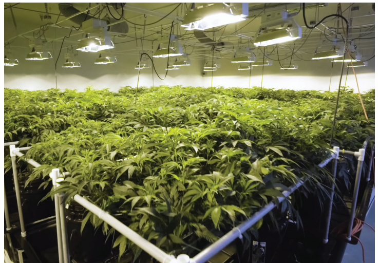
Temperature regulation doubles production.

The grow rooms operate on 12-hour cycles: 12 hours dark and 12 hours light. During the dark hours, the temperature is maintained at 75–78 degrees. Within 30 seconds of the lights coming on, the temperature can reach 99 degrees.